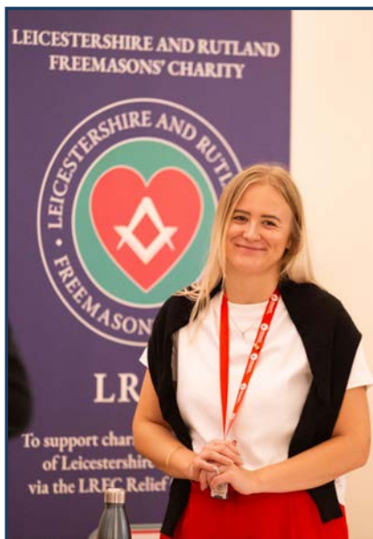
LRFC: Leicestershire & Rutland Freemasons Charity