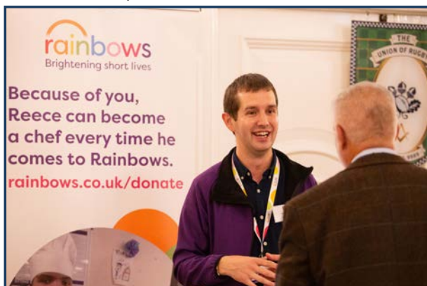
Rainbows: Representative from Rainbows talking at the charity morning.

The Carers Centre also received £3,000 to assist with the extremely valuable support they provide to carers within the local community.