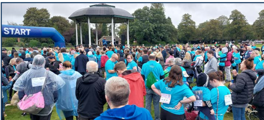
Crowds mustering for the Memory Walk.

The LRFC was able to match the totals that each of these brothers raised and we congratulate them, their Lodges, and their friends for all coming together to ensure that two worthy causes close to their hearts gained support and recognition.